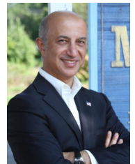
Mayor Mike Ghassali