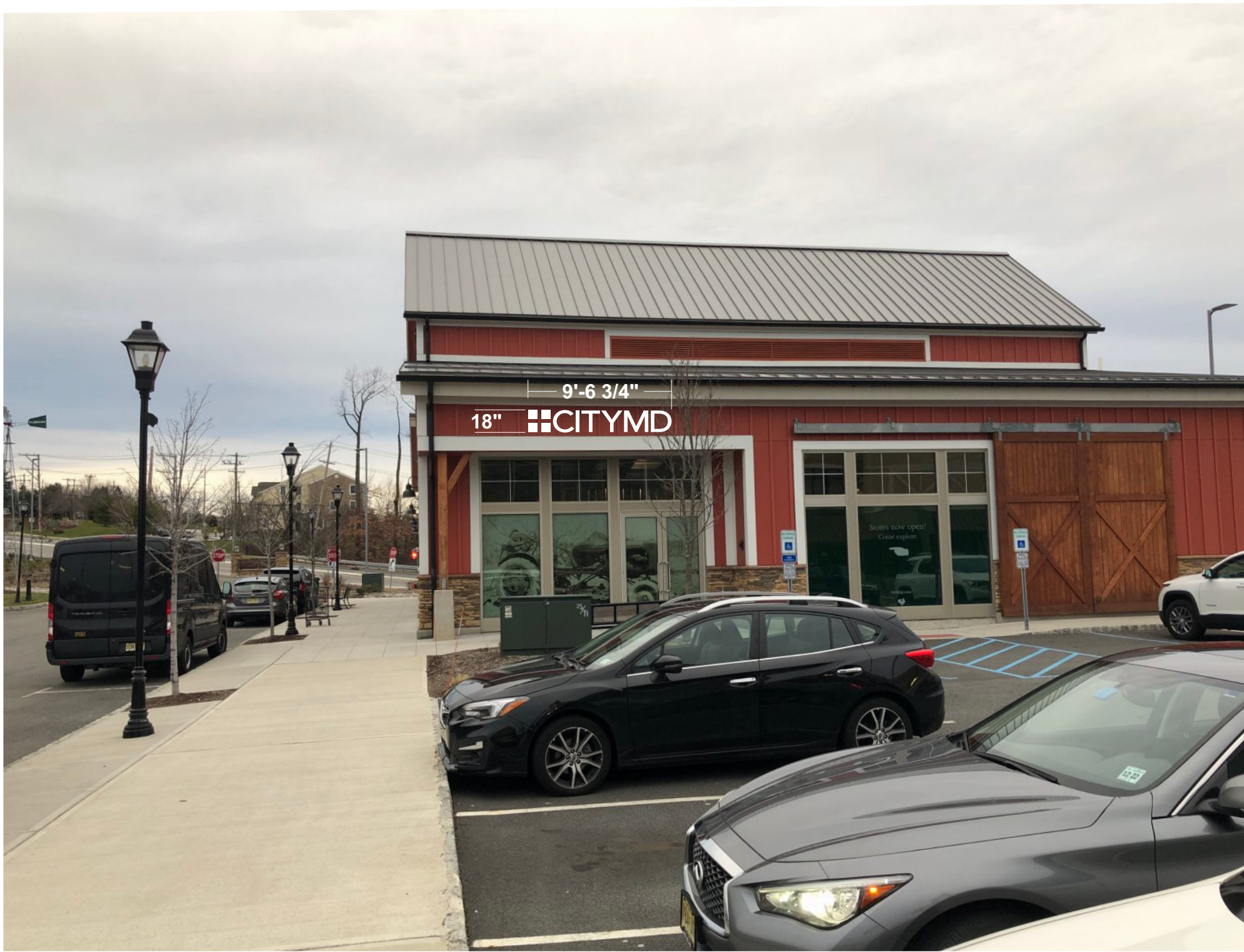
Proposed illuminated channel letter set on side fascia