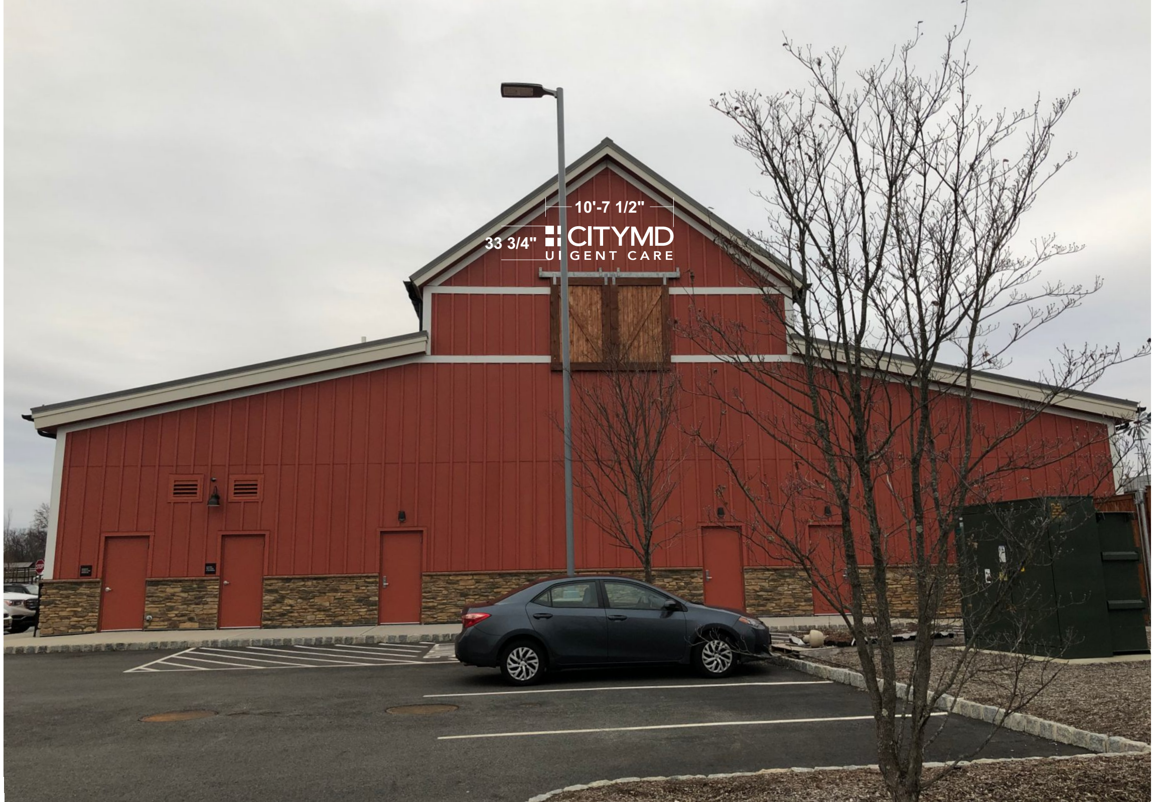
Proposed illuminated channel letter set on rear fascia