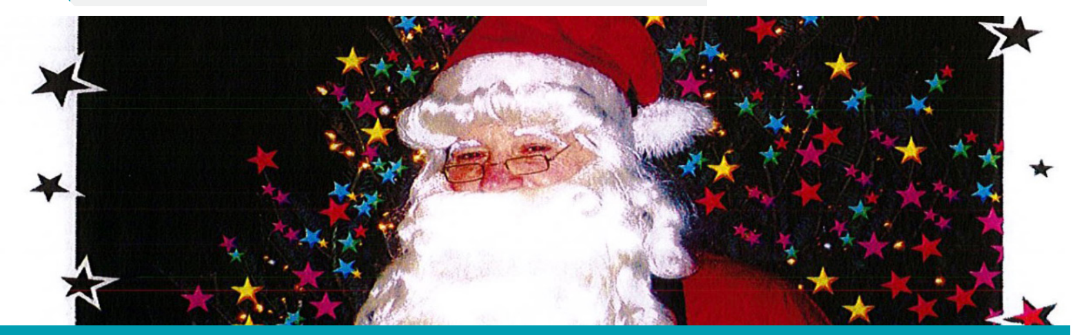
The Montvale Fire Department is proud to announce that we will continue the annual tradition of bringing Santa to town on Christmas Eve. See more on Page 2

A look at the Community, including upcoming events, important notices, meetings, and more.